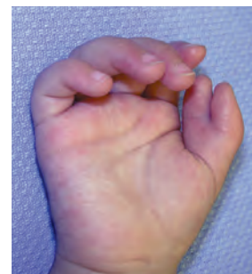
Figure 3: Thumb polydactyly, with duplication of the thumb

All babies born with congenital hand differences should be evaluated by a hand specialist to make an individual assessment of the type. Depending on the type of congenital hand difference, treatment may be recommended. For example, webbed fingers are surgically separated. Extra digits can be surgically removed with reconstruction of the remaining digit if necessary. Hand function can be improved if the functions of thumb pinch or finger grasp is compromised. Some congenital hand differences may need therapy to help improve hand function. In some cases, no intervention is necessary. More information on congenital hand differences can be found at the American Society for Surgery of the Hand website, www.assh.org , in the Patient and Public section called "Hand Conditions."