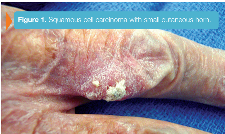
Figure 1. Squamous cell carcinoma with small cutaneous horn.

Melanomas often look like moles or birthmarks, but lesions that show increased growth, variations in color or shape, irregular borders, and/or are larger than 6 mm (1/4 inch) diameter are suspicious for melanoma. The letters 'ABCDE' provide an easy way to remember these warning signs, any of which could suggest a melanoma (see Figure 3 ). Melanomas have a very high potential to metastasize.