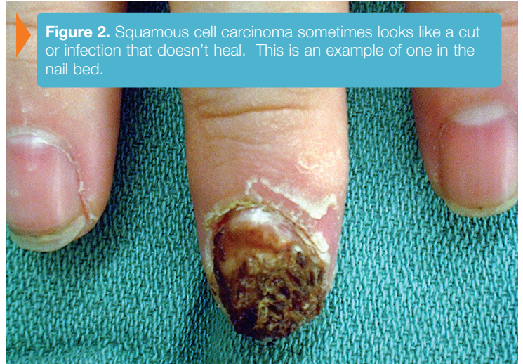
Figure 2. Squamous cell carcinoma sometimes looks like a cut or infection that doesn't heal. This is an example of one in the nail bed.